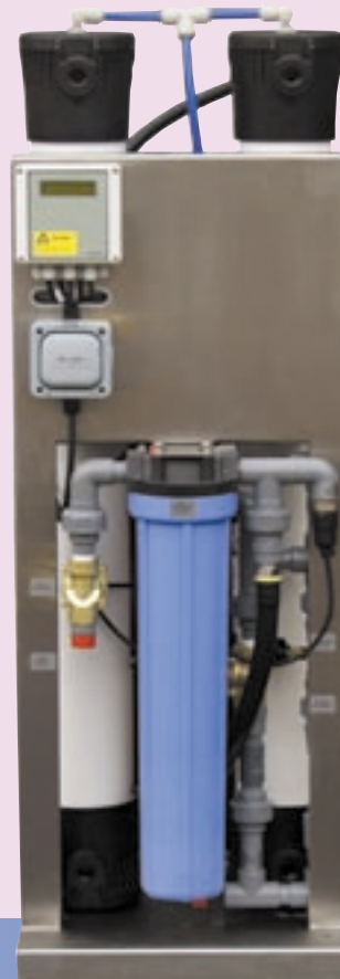
B Series RO

Test parameters -25°C, 150psi applied pressure, 6.5 - 7.0pH range, 15% recovery